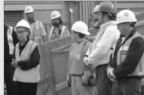
Gov. Gregoire, left, meets with construction workers at Tacoma General Hospital.

"We have doubled the number of apprenticeships in the state," she said. "We want our young folks involved in a trade... so we started 'Running Start for the Trades' and it is working. We've put billions of dollars into construction so that locals will be able to build the future communities across our state," she told the crowd. "We've put over $13 billion in construction transportation alone."